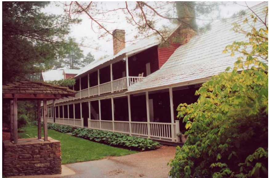
Glen-Ella Springs Inn